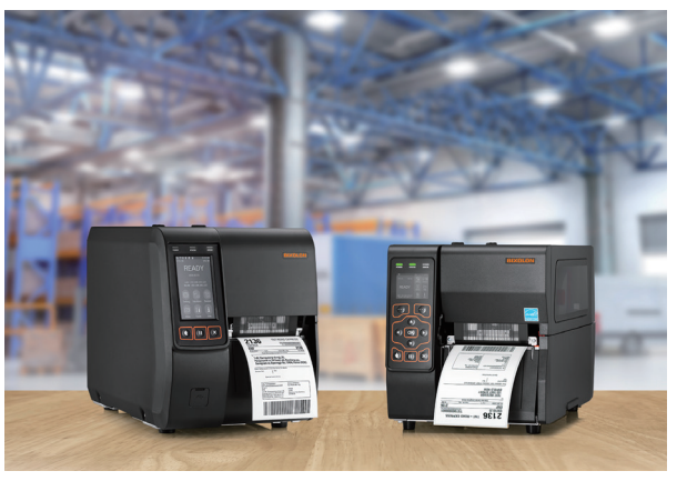
XT5-40 Series and XT3-40 Industrial Printers

XI enables users to streamline labelling operations by simply connecting peripherals into the printer preloaded with BAS files. The XI status (Stop / Running) can be easily controlled on the printer's LCD display.