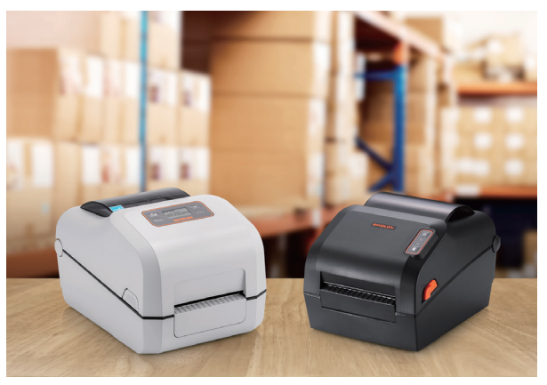
XD5-40 Series Desktop Printers