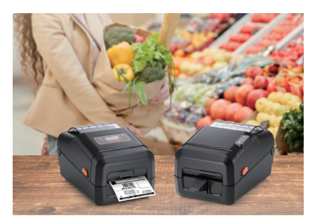
XL5-40 Exclusive Linerless Printer